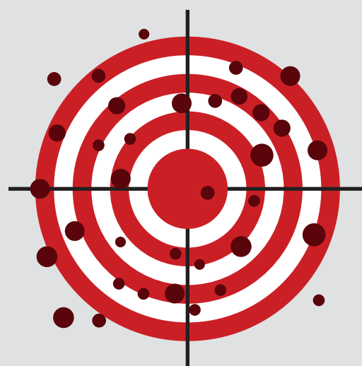
Unreliable, But Valid