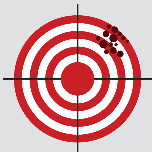
Reliable, Not Valid