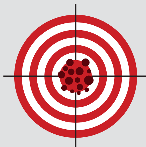
Both Reliable & Valid